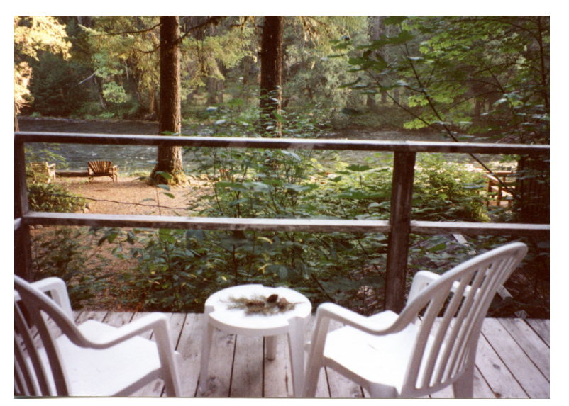
View from one of the "duplexes" at Cedarwood Lodge, 1996