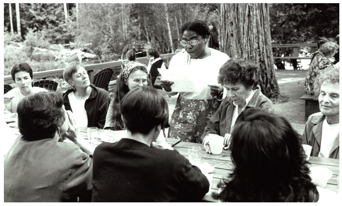
Critique group on terace, 1996