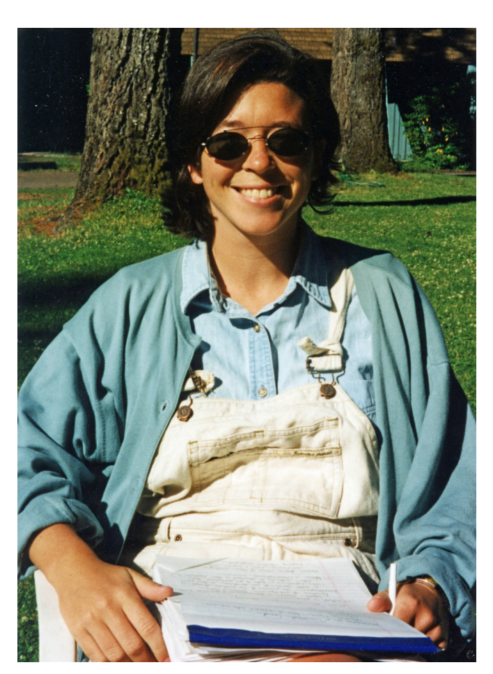
Participant in class, 1996